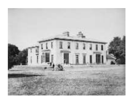
Ardamine House in about 1879