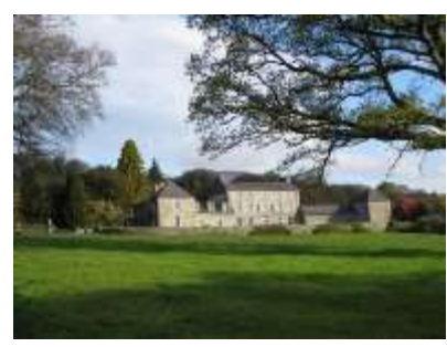
Monksgrange in 2012